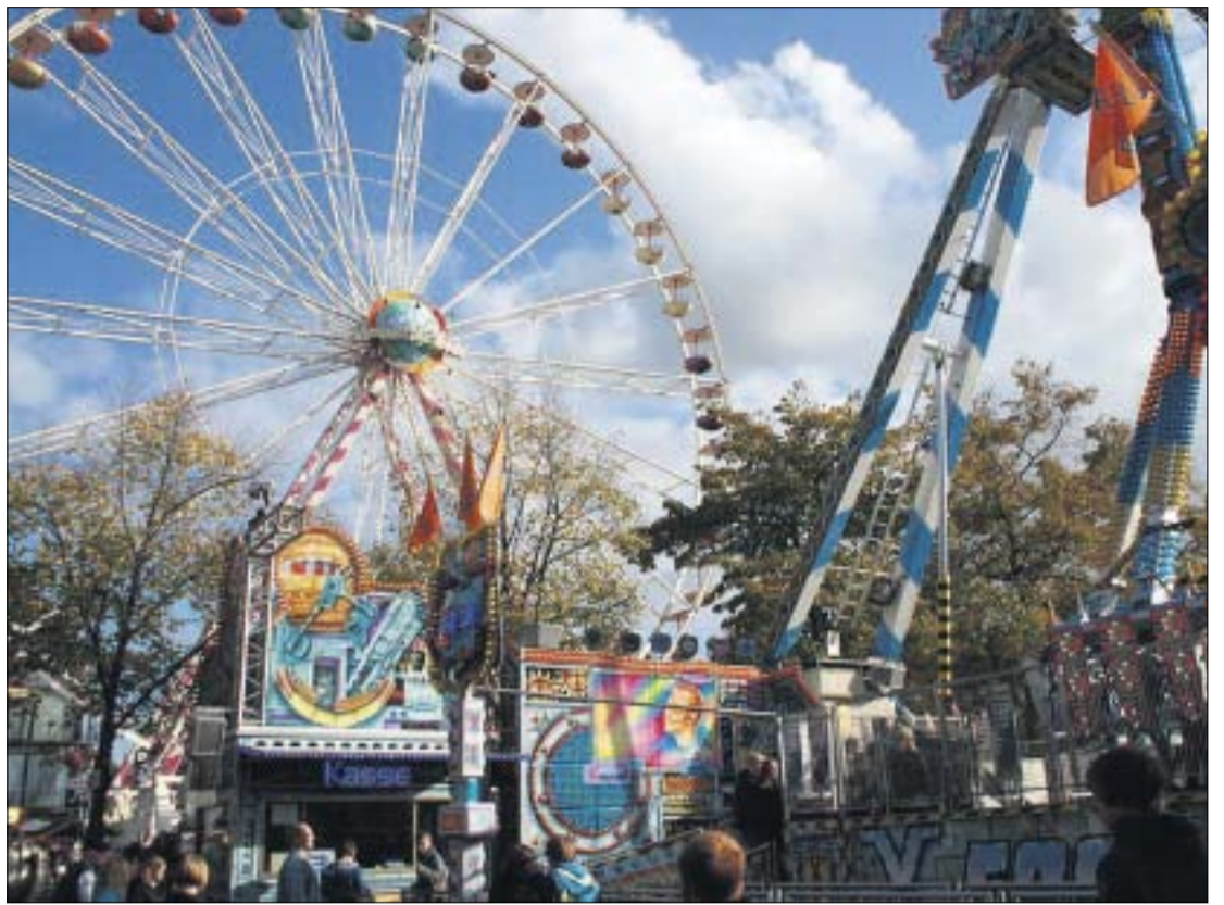
LEER TOWN CENTRE: Gallimarkt street festivities